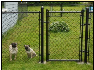
If not restrained behind a fence, kennels must provide your dog with adequate space for exercise.

Dogs must be adequately contained behind a fence on the property of their owner (adequate to prevent escape) and/or restrained in a kennel that provides adequate space for exercise suitable to the age, size, species and breed of the animal.